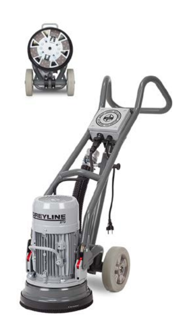
HTC GREYLINE™ 270 / 270 HD