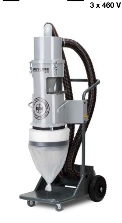
HTC GREYLINE™ PS

User area: Floor preparation & renovation, coarse grinding