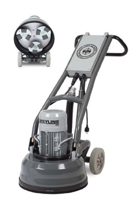
HTC GREYLINE™ 450 / 450 HD