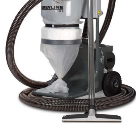
HTC GREYLINE 25 / 35 D HTC GREYLINE™ 40 D